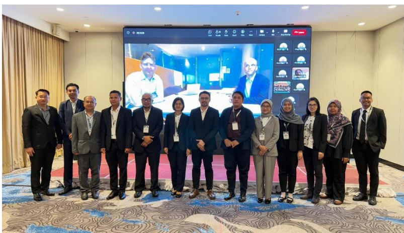
Photo 1. Participants of PEEB ASEAN's Kick Off Meeting in Selangor, Malaysia, 19 May 2025.

Selangor, 19 May 2025 – The ASEAN Centre for Energy (ACE, or the Centre) has officially launched the implementation of the Programme for Energy Efficiency in Buildings in ASEAN (PEEB ASEAN) through a kick-off meeting held in Selangor, Malaysia, on 19 May 2025. Financed by France through the Agence Française de Développement (AFD), PEEB ASEAN serves as a 4-year-long initiative to support ASEAN's transition towards more energy-efficient, climate-resilient, and environmentally sustainable buildings.