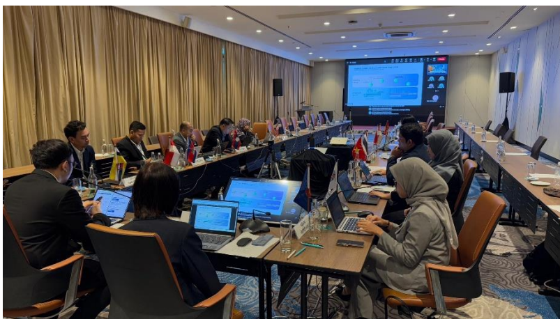
Photo 3. Participants of PEEB-ASEAN's Kick Off Meeting in Selangor, Malaysia, 19 May 2025.

fundamental priority, hence investing in energy-efficient buildings presents an opportunity to advance ASEAN's journey towards sustainability, resilience, and inclusive growth. We look forward to continued collaboration with the Centre through PEEB ASEAN."