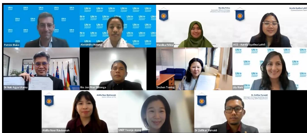
Photo 2. Speakers at ACE-UNEP webinar, titled “Advancing Energy Transition in ASEAN through Energy Efficiency and Gender-Responsive Policy.”

The webinar featured key speakers from ACE and UNEP who discussed current activities and future plans in this cooperation. The first panel, "Enhancing Energy Efficiency in Appliances, Cooling, and Transport in ASEAN" focused on achieving a more energy efficient and resilient future, through strengthening collaboration, improving energy efficiency standards for appliances, passive cooling strategies, and sustainable E-mobility technology. Followed by the second panel, "Advancing Sustainable Energy and Gender Inclusion in ASEAN," focused on collaborative efforts in ASEAN's energy transition and gender mainstreaming and gender just transition for climate resilience.